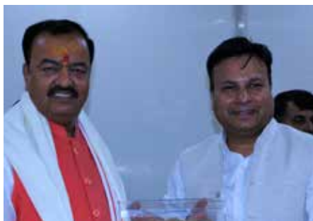
Hon'ble Shri Keshav Prasad Maurya Ji, Deputy Chief Minister Uttar Pradesh

Besides having an illustrious Advisory Board, Sanskriti University has been blessed by regular visits of highly placed dignitaries of very renowned personalities, to name a few: