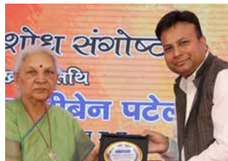
Hon'ble Smt. Anandiben Patel Ji, Governor of Uttar Pradesh

Besides having an illustrious Advisory Board, Sanskriti University has been blessed by regular visits of highly placed dignitaries of very renowned personalities, to name a few: