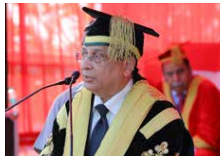
Hon'ble Mr. Dipak Misra Ji, Former Chief Justice of India