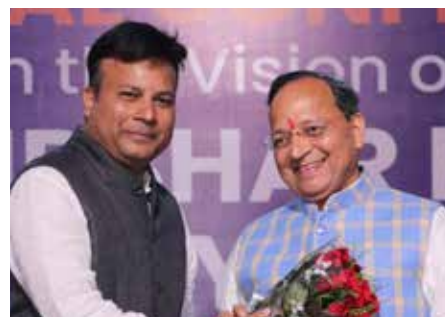
Hon'ble Shri Arun Singh ji, Member of Parliament, Rajya Sabha & National General Secretary BJP