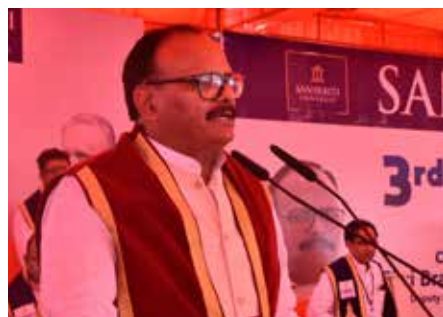
Hon'ble Shri Brajesh Pathak Ji, Deputy Chief Minister Uttar Pradesh