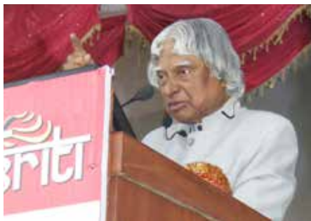
His Excellency Late Dr. A.P.J. Abdul Kalam Ji