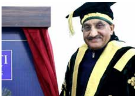
Education Minister, Shri Ramesh Pokhriyal Ji